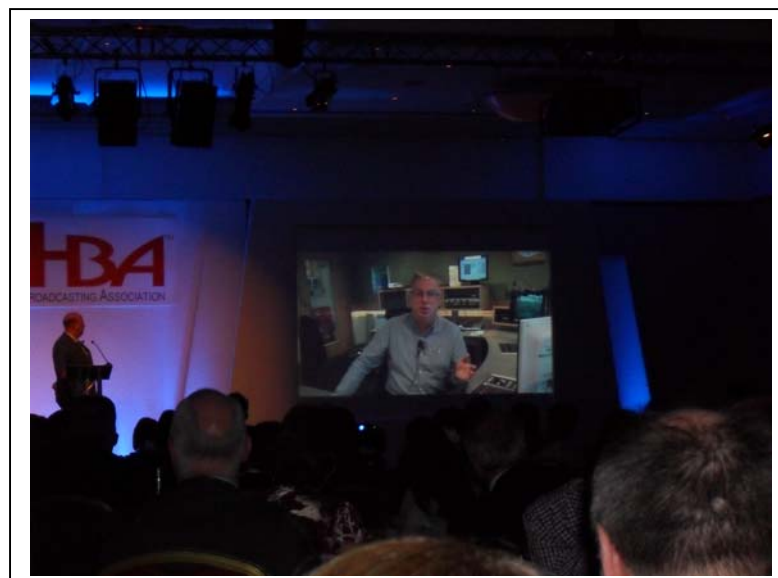
HBA Ambassador and BBC Radio 2 presenter Ken Bruce appears on the big screen with a message for all those at the National Hospital Radio Awards